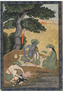
Title: Ramayana. Site: http://www.asia.si.edu/devi/fulldevi/deviCat71B.jpg